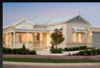
The Gables: Coralvine Grange, Stirling Phone: 9440 4133