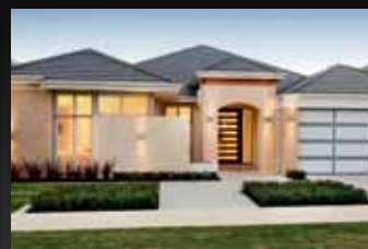
The Sanctuary: Backwater Circle, Burns Beach Phone: 9304 9822