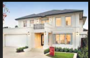
The Toorak: Dunblane St Corner Pearson St, Floreat Phone: 9284 0000

Display centres open: Sat & Sun 1-5pm, Mon & Wed 2-4.30pm. Head Office: 42 Hasler Rd, Osborne Park WA Ph: 9446 5500